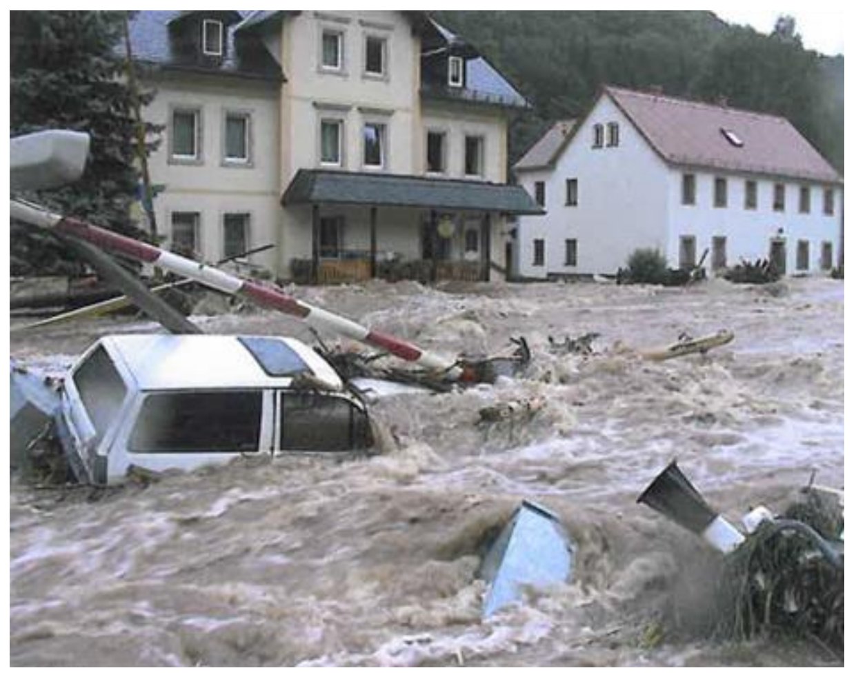
Deltares image library

This European Directive came into effect in 2007. In the Netherlands, the Floods Directive is regarded as an important legal instrument for coordinating objectives and measures pertaining to mitigating flood risk with the catchment partners and/or neighboring countries.