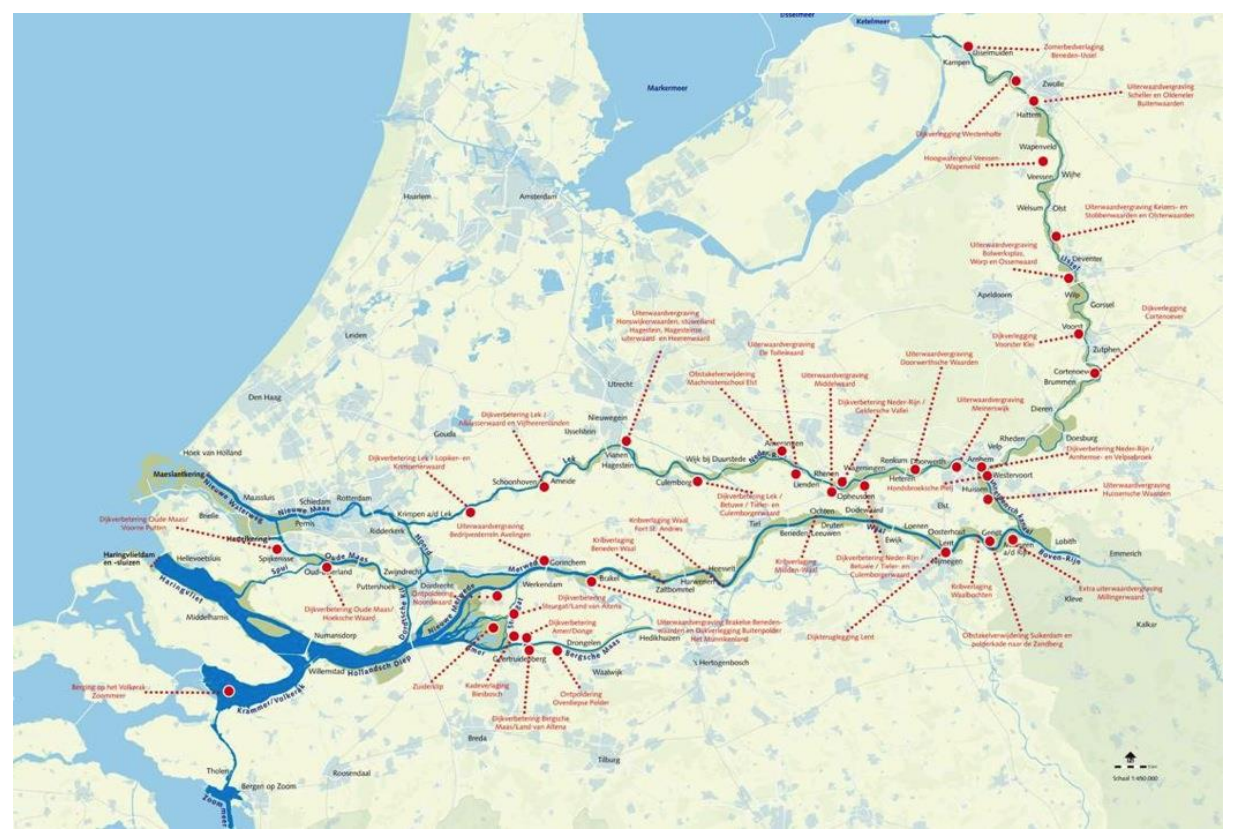
Figure 2. The 39 measures implemented (www.ruimtevoorderivier.nl)

To cope with the objectives 39 measures were selected to lower the flood level of the River Rhine and its branches in the Netherlands (figure 2). The 'Planning Kit' was used to select the 39 measures. This tool consists of a collection of (hydraulic) model results and an estimate of costs and compared various measures. It was used to take well informed decisions. The 39 measures should enhance spatial quality (Klijn et al, 2012). In order to meet this goal an interdisciplinary Quality Team (Q-team Room for the River) was installed. This Q-team was commissioned to coach planners and designers, to peer review the designs and plans on spatial quality (Klijn et al, 2013). The final implementation of the measures was decentralized to local or regional authorities (like water boards), sometimes partly to private parties.